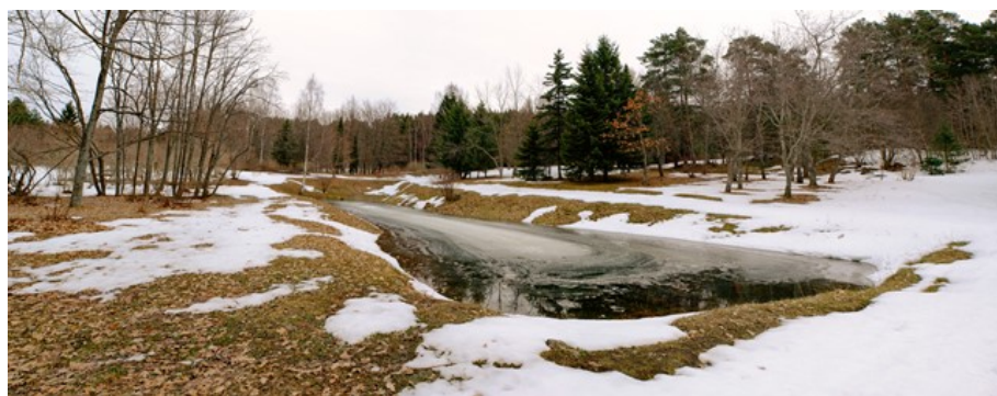
Arboretum in early spring