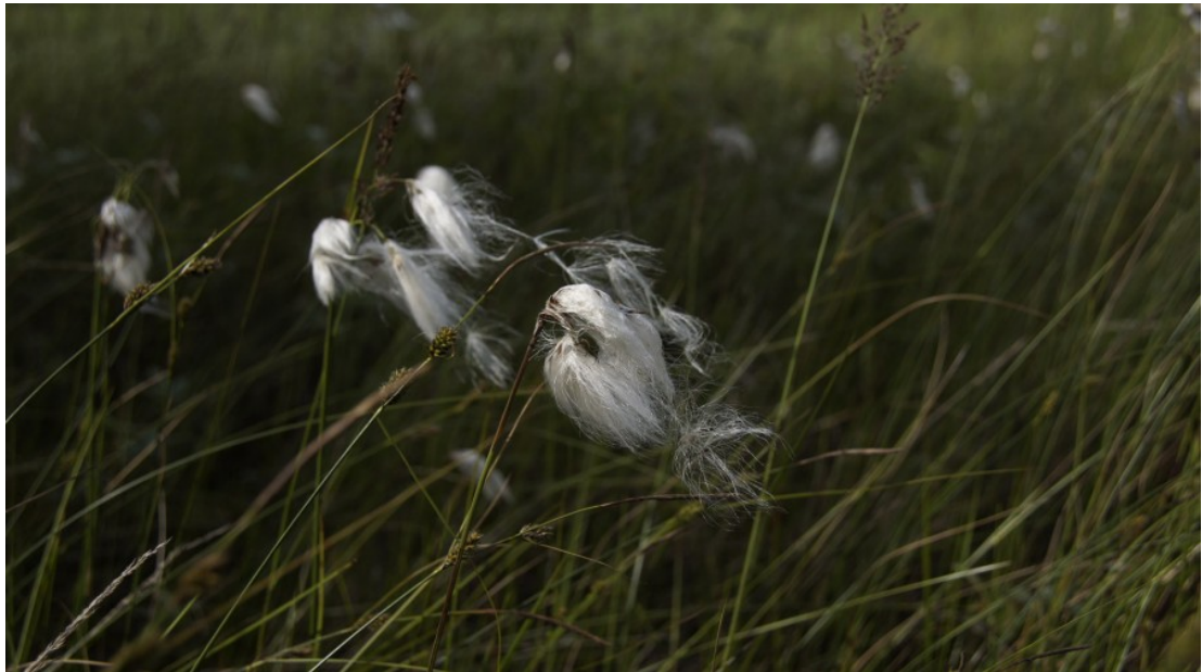
Eriophorum angustifolium Honck.