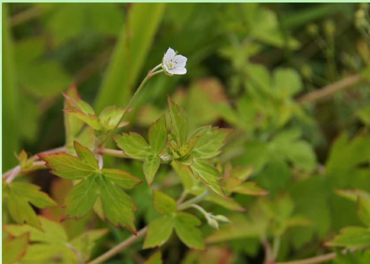
Geranium thunbergii Siebold ex Lindl. & Paxton.