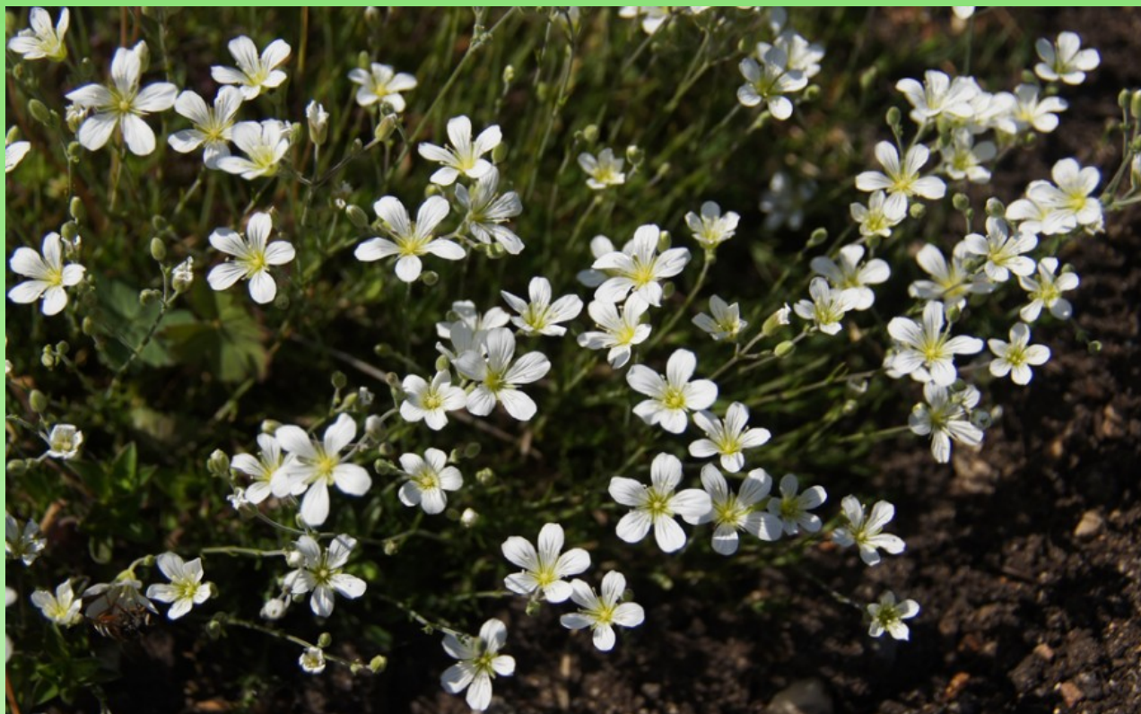
Minuartia laricifolia (L.) Schinz & Thell.