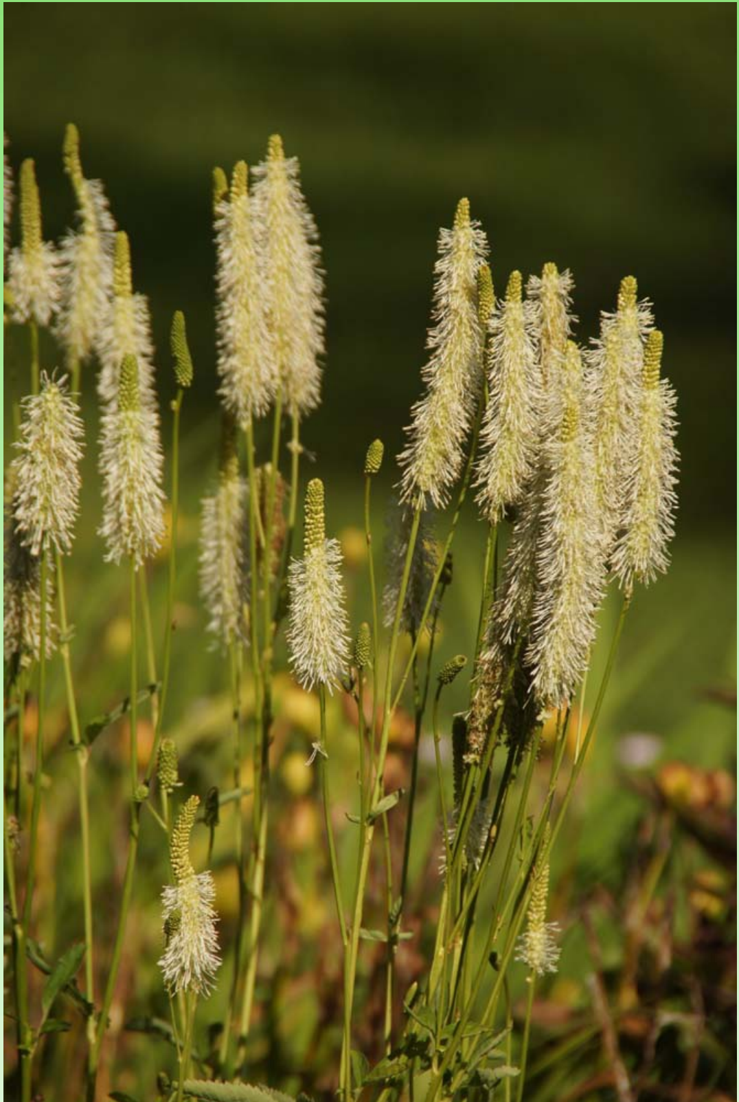
Fig.3. Sanguisorba canadensis L.