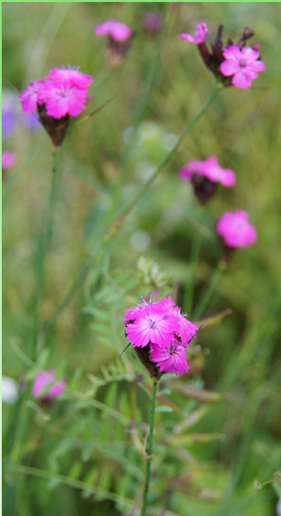
Fig.2. Dianthus giganteus subsp. banaticus (Heuff.) Tutin