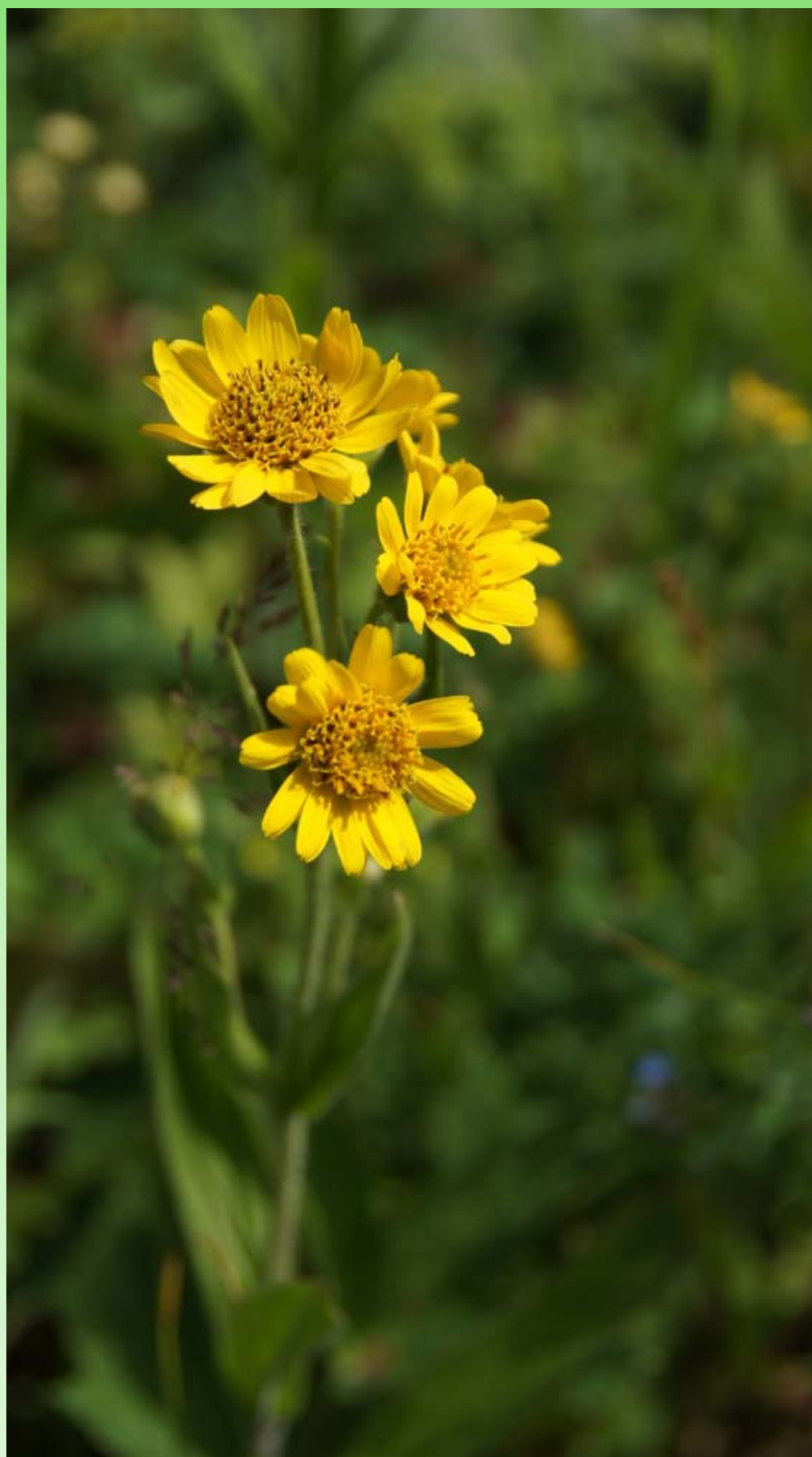
Fig.4. Arnica lanceolata Nutt.