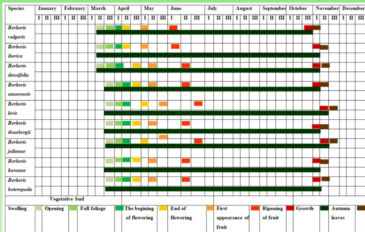
Fig. 1. Phenospectrum of Berberis species in Absheron conditions.

The first flowering of the studied varieties of Berberis occurs between the end of April and the first decade of May, mass flowering between the first decade and end of May (Fig. 1).