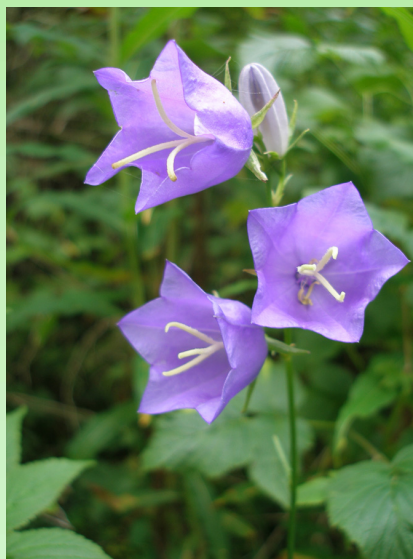
Campanula persicifolia L.