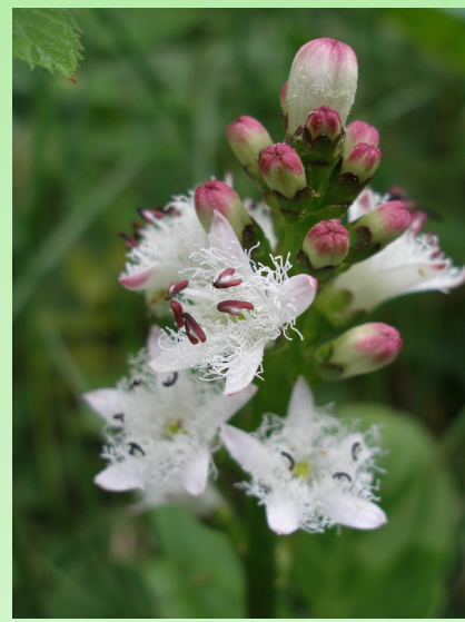
Menyanthes trifoliata L.