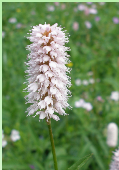
Persicaria bistorta (L.) Samp.