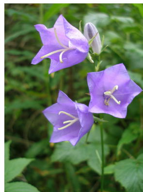
Campanula persicifolia L.