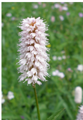
Persicaria bistorta (L.) Samp.