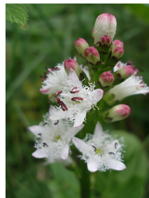
Menyanthes trifoliata L.