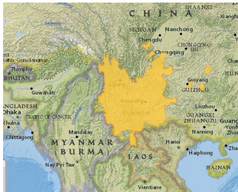
Fig. 1. A map of the natural distribution range of Magnolia delavayi.

Delavay's Magnolia or the Chinese Evergreen Magnolia is a species of magnolia native to southern China. It was discovered to western science by the French missionary and plant collector, Père Jean-Marie Delavay. Delavay (1834-1895) was a plant collector for the French National Natural History Museum in Paris and contributed a large number of herbarium specimens to its collection (Kilpatrick, 2014). He also collected seed and fruit that were cultivated in the Jardin des Plantes in Paris. His collecting endeavours have been acknowledged in many plant names, M. delavayi being the most obvious. Magnolia delavayi was brought into cultivation by Ernest Henry