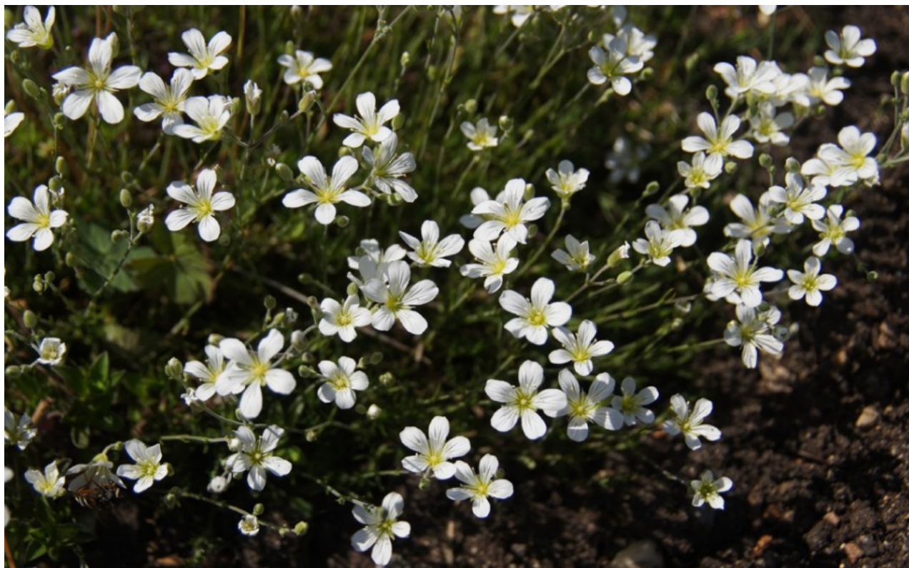
Minuartia laricifolia (L.) Schinz & Thell.