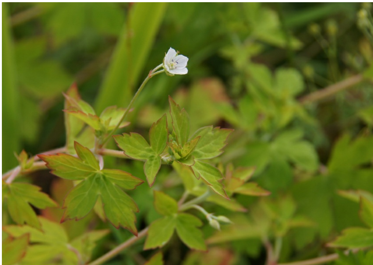
Geranium thunbergii Siebold ex Lindl. & Paxton.