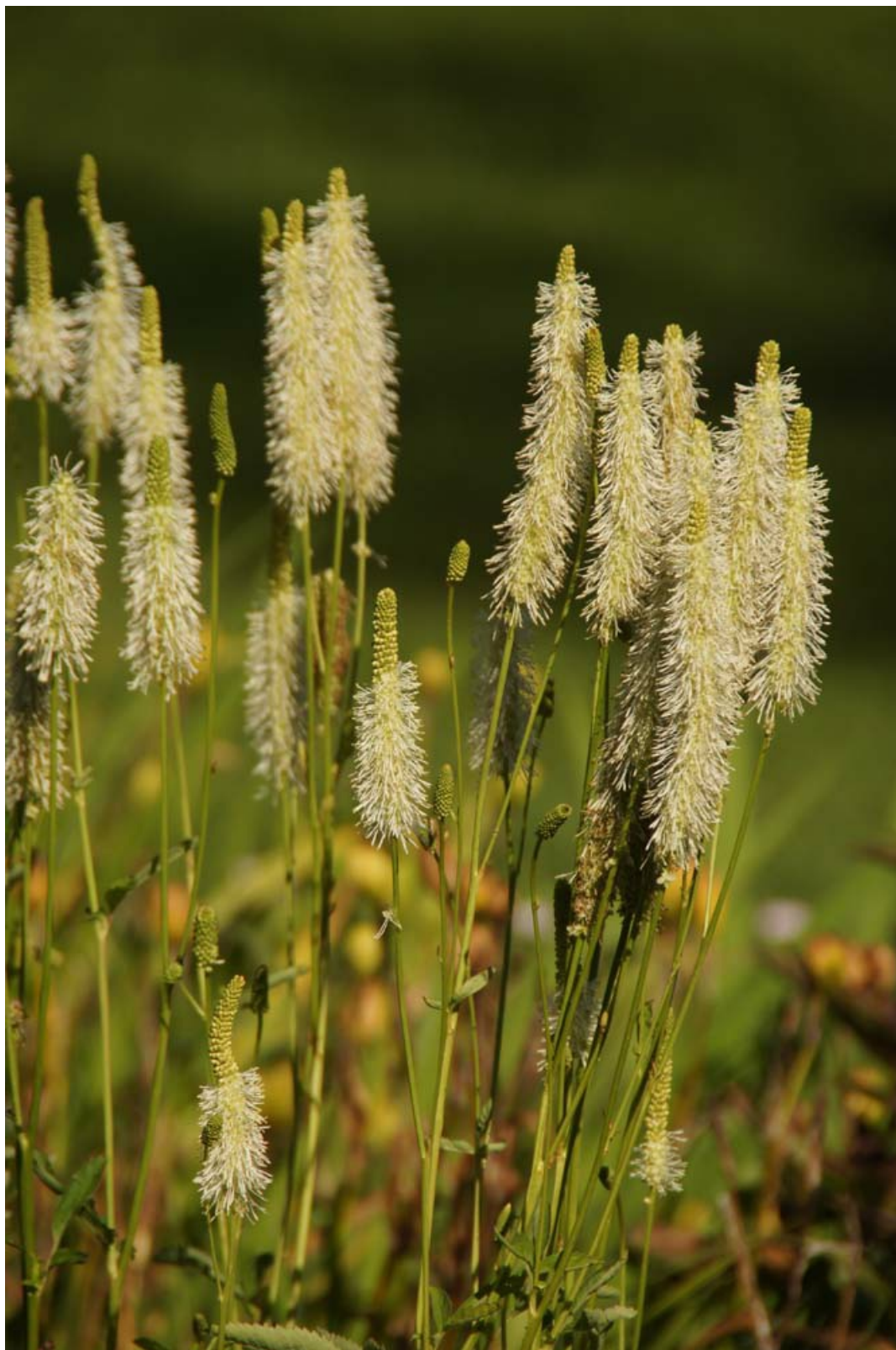
Fig.3. Sanguisorba canadensis L.